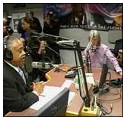
"Whether from a best friend, favorite celebrity, Don Imus, or even from the U.S. Senate floor, teens are learning that once taboo four-letter words and derogatory statements can be used at any time and at any place."