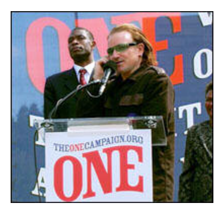
"The greatest way to teach about poverty is to experience poverty."