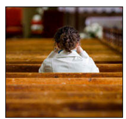
"The bottom line is to not leave these questions alone for your teen to find any answer all on their own. Pray, encourage, and equip your teen in their spiritual development."